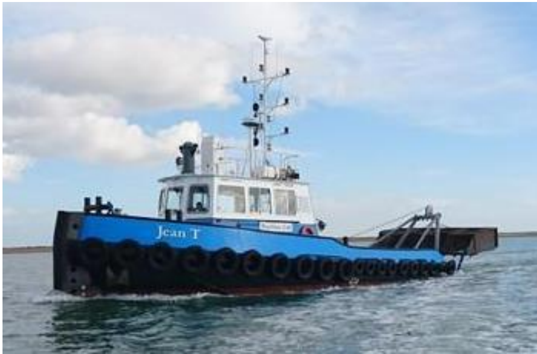
Jean T – 16.89m LOA

For further information contact Harwich VTS (VHF 71) .