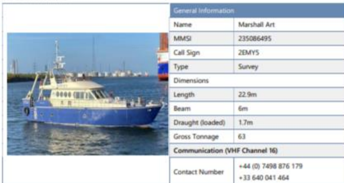
Table 3: Marshall Art

Survey operations will be conducted on a 24-hour basis.