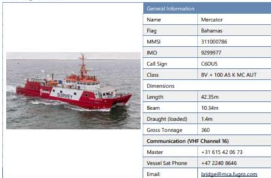
Table 2: Fugro Mercator

Survey operations will be conducted on a 24-hour basis.